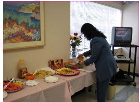
Pink Day patient enjoying healthy refreshments while the education video plays in the background.