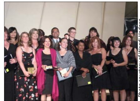
CLI "Cohort 1" Inaugural Graduating Class

Blue Shield of California Foundation recognized the importance of cultivating leaders to strengthen health clinics so they created CLI which works through a partnership with UCSF Center for the Health Professions. Participants commit to an 18-month, part-time program to build their skills in areas such as decision-making, financial management, and strategic planning. They become leaders in the community clinic field by attending seminars designed specifically for